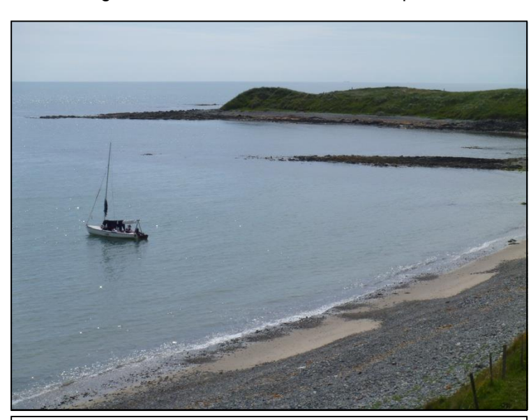
Spree Lady anchored off the coastline near Polduff.

This stopover point was the first unprotected anchorage of our cruise and it became noticeably more of a challenge to transition from cruise mode to boat camping mode in the absence of a pontoon on which we could temporarily stow our gear while re-arranging Coupled with the lively things. rolling and pitching of the boat, I was more than retrospectively grateful for all of our previously protected berths. Even so, nothing was lost overboard and Ralph served up a much appreciated meal of chicken stew con pasta, Tubourg beer and the last of our bread. As the wind subsided and the gentle rolling diminished, sleep came quickly and soundly.