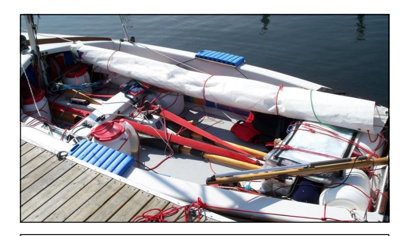
Spree Lady packed and made ready for the day's sail.

Day 2 - After breakfast we readied the boat for sailing. It was the reverse of everything accomplished the previous evenina. Even if the twice-daily drill became familiar, it was still over an hour of meticulous stowage and attention paid to lashing everything into its proper place. Sisyphus has nothing on this dinghy cruiser! We eventually cast off in a beautiful F3 breeze, bound for Dublin . with as many or few stops as we fancied or the changeable weather dictated.