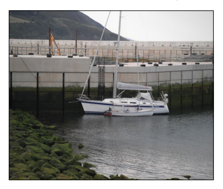
Spree Lady tied up to the only convenient mooring facility in the unfinished harbour of Greystones.

It was actually sunny and we made good speed until the tide turned, when we began to slow appreciably. Ralph set up the spinnaker to compensate. The tide was most definitely foul by Wicklow Head and there were visible rips as we approached the point. It was a struggle, but we eventually rounded the point and Ralph called for a change of helm to execute a gybe. I bungled it whilst handing the helm and we accidentally gybed all standing. or in my case falling. onto the lee side of the boat. I was sorry, embarrassed, and we were lucky that nothing fouled, broke or resulted in a capsize. Ralph, having moved quickly to balance the boat, sorted out the mess and retrieved the spinnaker.