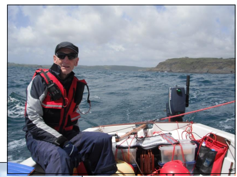
Leaving the bay of Union Hall and Glandore, and heading out for Kinsale in lively wind conditions.

Sailing in strong winds and rough seas with a fully furled genoa and 2 reefs in the main.