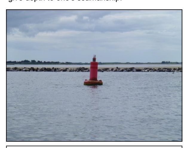
The deep water channel was well marked, with the sand bar behind packed with seals.

Day 19 - The departure from Wexford became a living example of what I'd only read about in the lore of dinghy sailing. Our course offered a fair wind and tide. Ralph decided we may as well save all of three teaspoons of fuel and just "shoot the bridge". That is to say, lowering the mast under sail in order to transit the bridge and then raising the mast after clearing it. If not done properly, things can quickly go disastrously wrong. We got underway on genoa only, boom unshipped and stowed. Once clear of the bridge we raised the mast, shipped the boom and hoisted the main. All went smoothly and there was a decent sense of satisfaction in having performed one of those rare manoeuvres that give depth to one's seamanship.