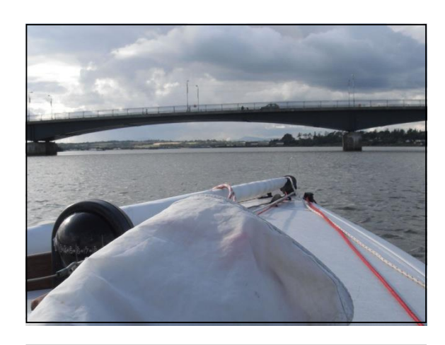
Approaching Wexford bridge under motor.

Over a much-yearned-for Guinness, we were graciously granted permission to tie up to the pontoon for the evening. Before enjoying a hot, delicious, skipper-prepared dinner of pasta and chili con carne, we were treated to a great flurry of sailing club activity, involving an enthusiastic fleet of