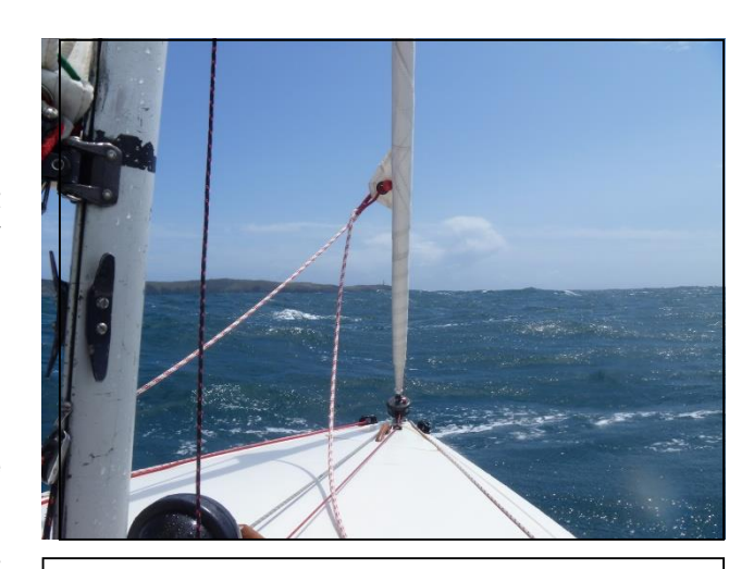
Sailing the southern Irish coast in F. 6/7 winds.

Upon completing the cruise, I often asked myself why two respectfully-past-mature, apparently sensible gentlemen would want to risk such a potentially perilous undertaking. After all, it is a commonplace knowledge that the waters off southern Ireland are routinely treacherous and the weather moody. (In 2011 alone there were on average of 22 lifeboat launches per day off Ireland's coastal waters). Even in the most unlikely coastal crannies we often saw the largest and most powerful RNLI lifeboats solemnly poised to intercede on behalf of those who, either due to poor planning, lack of skill, incapacitating injury, or just a stroke of bad luck, needed seaborne assistance to avoid what might certainly become an irreversibly grim fate.