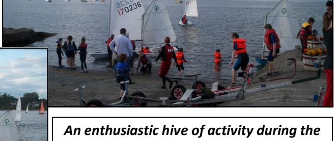
An enthusiastic hive of activity during the training evening at Wexford Sailing Club.

Squalls pass, and this one was no exception. We eventually progressed further into the harbour, where we became intimately familiar with the Slobs, our progress being continually punctuated by warnings from the depth sounder - aka Spree Lady's centre plate. We found there were no berthing facilities available for small craft except west of Wexford Bridge, and a bridge too low to transit without lowering the mast. To accomplish this, Ralph approached an unused mooring buoy, which I clung to as he proceeded to lower away. With mast secured, we motored against the wind under the bridge and upriver to the local sailing club.