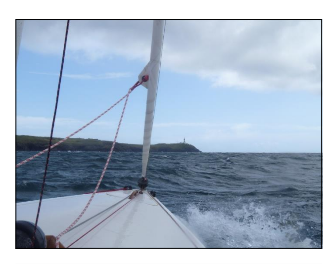
Spree Lady heading for Kinsale in strong winds.

Spree Lady is scampering along nicely in spite of the secondary waves reflecting back through the primary, Atlantic-born waves destined to hurl themselves against the Irish headlands. Suddenly I hear Ralph call out and quickly turn to see whates up. Ralph is indeed, (in the technical sense) still at the helm, tiller extension very much in hand. The one aspect of this scene that is utterly alarming is that Ralph is not inside the boat, hers in the water. He remains attached to the boat by nothing more than the small piece of rubber which connects the tiller to the extension! In that split second between panic and adrenaline-fuelled action, a most terrifying scenario flashes through my mind . a fate which, even now, I am reluctant to contemplate.