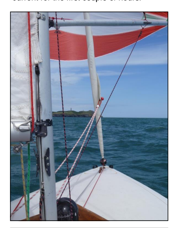
Approaching Wicklow Head with the tide now running strongly against us.

Day 21 - Well rested and nourished we made a leisurely departure around 11:00. There was a useful southeast F3 wind and a favourable current for the first couple of hours.