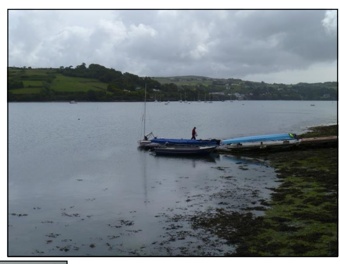
Spree Lady tied up on a pontoon that is normally for the exclusive use of the local rowing club.

A local police constable was a keen sailor and enquired about our cruise.