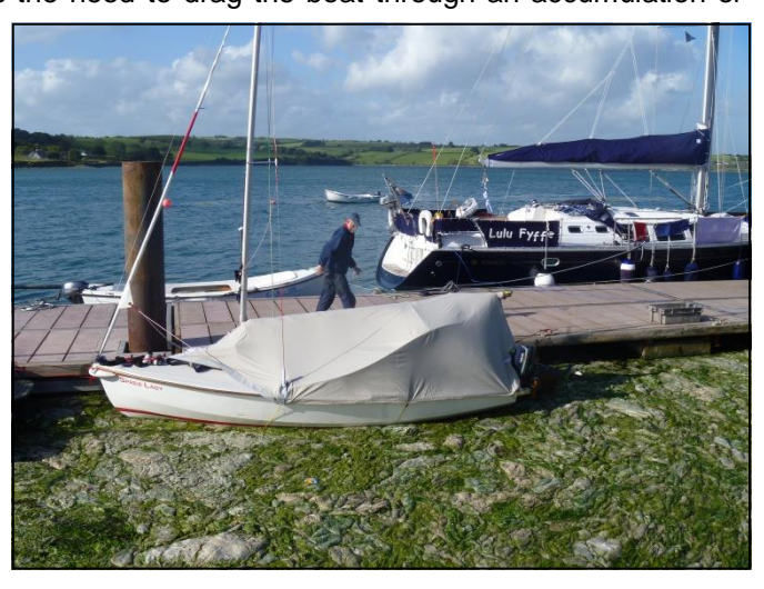
Snugly moored against the pontoon for the night.

Finally fed and tucked in for the night, I was more than ready for a quiet nights sleep. Although Spree Lady was resting silently on her green algal quilt, the sloping gangway leading down to the pontoon intermittently creaked and groaned for the next 6 hours on a falling tide. The sounds reminded me of Hollywood movies in which submarines are taken to their % rush depth+. My dreams were sprinkled with scenes of seams springing leaks which (perhaps not so oddly) coincided with my need to % pend a penny+.