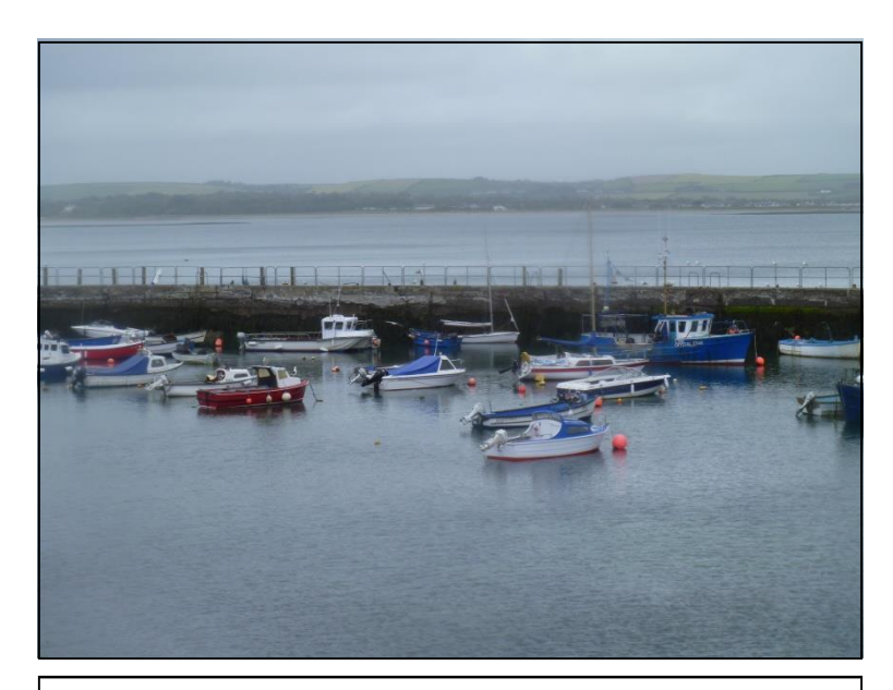
Spree Lady tied up to the harbour wall at Ballycotton – there being no other means of getting ashore.

Day 9 - The continuous rain of the previous day finally abated and by mid-morning we were able to cast off. The bright sun reigned supreme and we enjoyed perfect (F4) offshore breezes, broad reaching for hours and planing from time to time. By mid afternoon we entered the rather minimal harbour of Ballycotton, which had so many permanently moored work boats with lines criss-crossing around the harbour that it appeared to be an obvious confirmation of the latest String With no convenient Theory. mooring buoys available, we tied up to the high-walled breakwater using long spring lines, which needed intermittent adjustment to accommodate the tides.