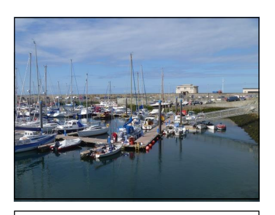
Spree Lady moored up at Kilmore.

The entrance to the harbour was narrow enough, guarded as it was by a high breakwater, but made even more challenging by two large fishing vessels moored on either side that towered above us, and effectively blocking our wind. Getting through became another unexpected test of seamanship. After near interminable tacks in the variable shifting airs, we finally emerged from the fishing vessels' wind shadow, and now had more than enough wind to lay a short course toward the crowded pontoon moorings. Judging from the round of applause given by the crew of an adjacent yacht, a gentle nosing into a vacant berth under sail is a rare occurrence in the harbour at Kilmore. We treated ourselves to a most welcome hot shower, followed by a deliciously decadent dinner at the Silver Fox.