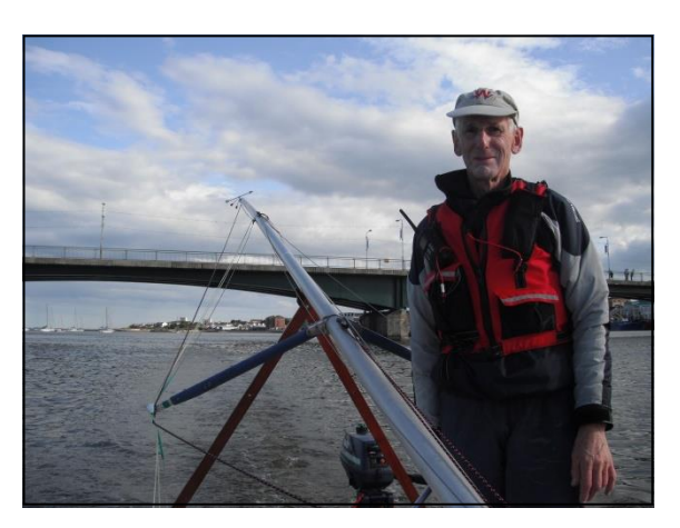
The boom crutch used to support the mast.

This long stretch of shore-hugging finally brought us to the outer limits of Wexford Harbour. The harbour is natural and lies at the mouth of the River Slaney. In earlier times it was considerably larger than today, up to 10 miles wide with mud flats on both sides known as the North and South Slobs from the Irish word slab meaning mud. At this point we had to surrender our beam reach for a very wet (wind now against tide) beat, requiring a single reefed main and reefed genoa. This was also coupled with a vicious squall, with the rain lashing us in sheets. It was one of the wettest and most uncomfortable parts of our cruise.